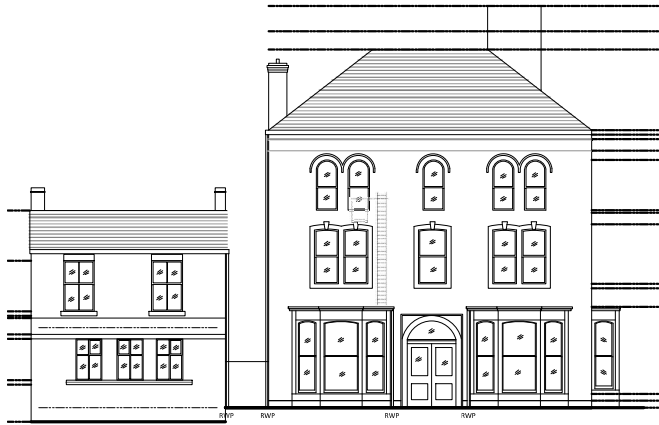
ELEVATION 01, LEFT SIDE, BOWESFIELD LANE SCALE 1:100