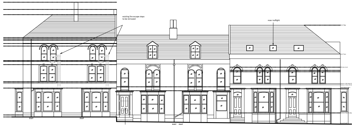
ELEVATION 02, FRONT, YARM LANE SCALE 1:100