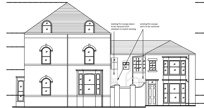
ELEVATION 03, RIGHT SIDE, LAWRENCE STREET SCALE 1:100